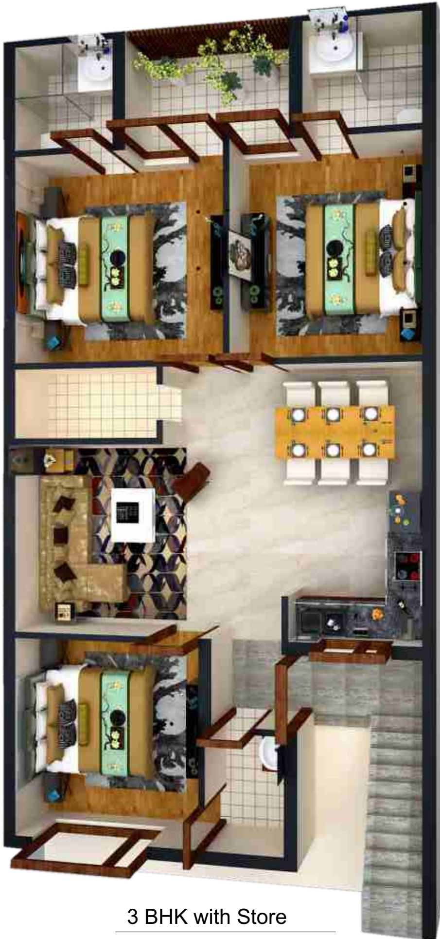
3 BHK with Store