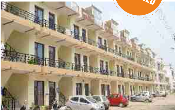
AMAN HOMES - Phase 1 Sector 125, Mohali