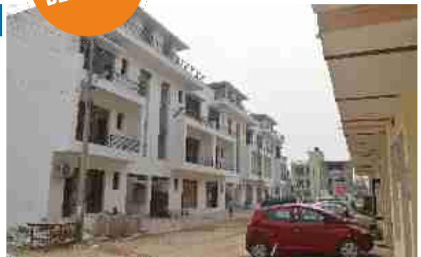
AMAN HOMES - Phase 2 Sector 125, Mohali