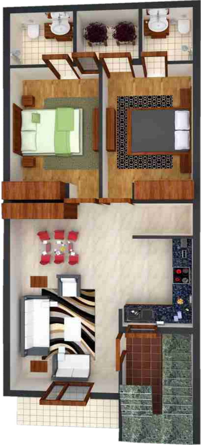
2 BHK WITH STORE