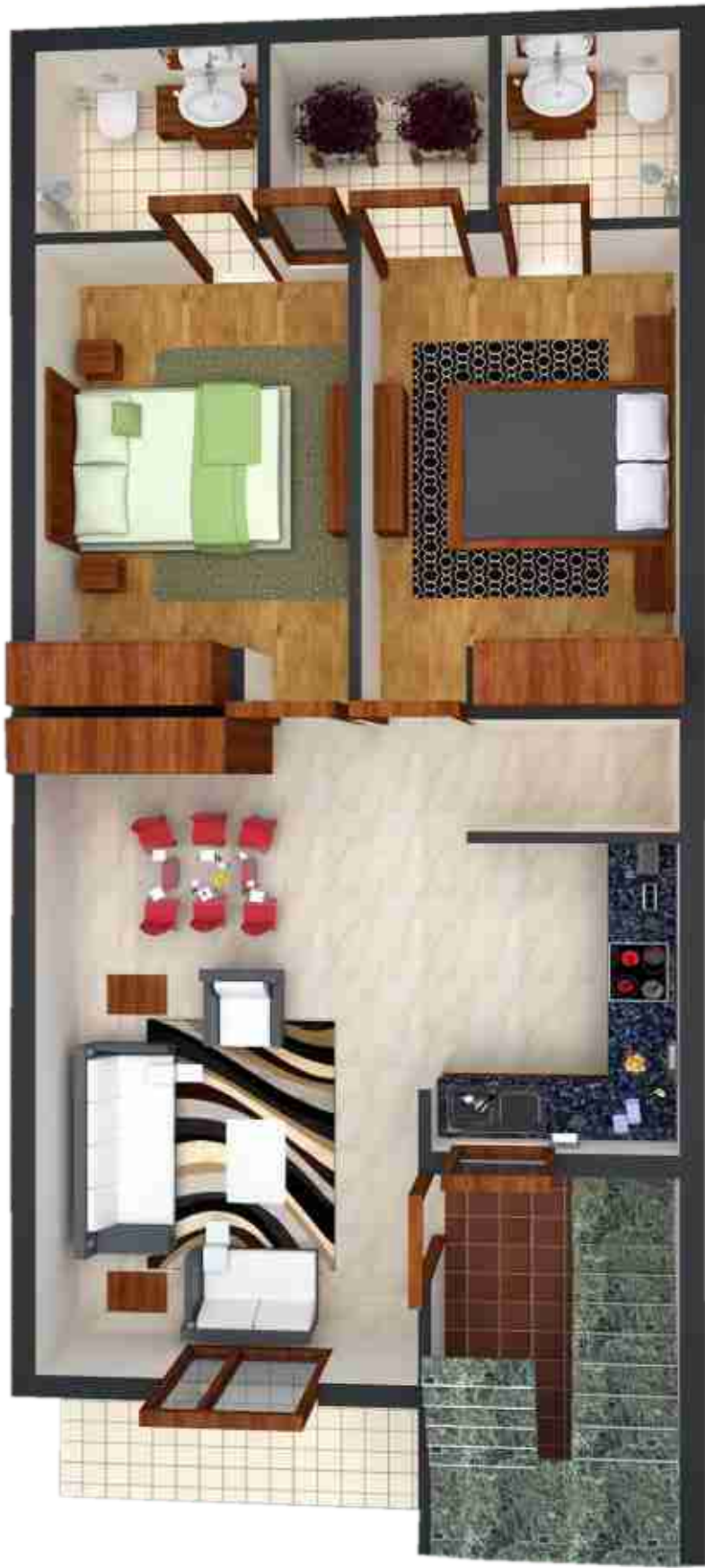
2 BHK WITH STORE